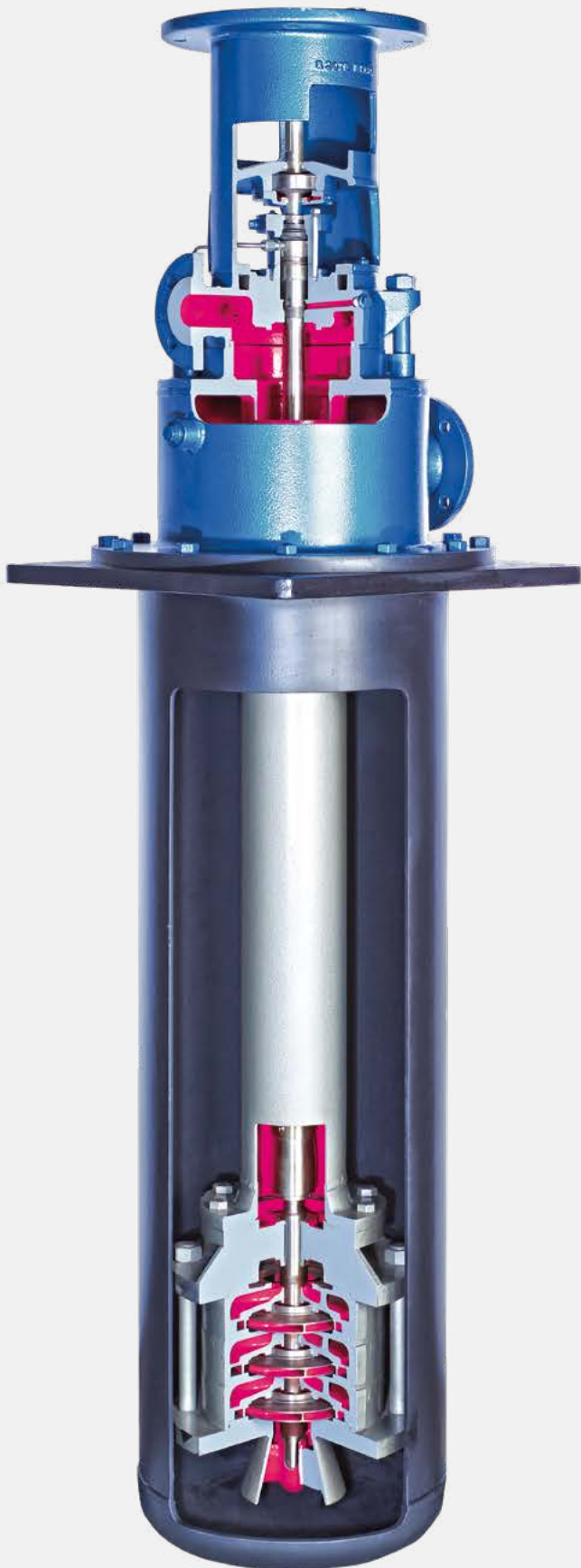
Multistage high pressure pump constructed as barrel-type pump: Q max. 400 m 3 /h, H max. 400 m